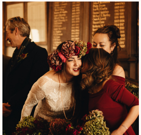
Bride wears Seraga jewellery.

If you are considering holding your ceremony in The Guildhall, you are welcome to view the venue first. Please contact us to make arrangements.