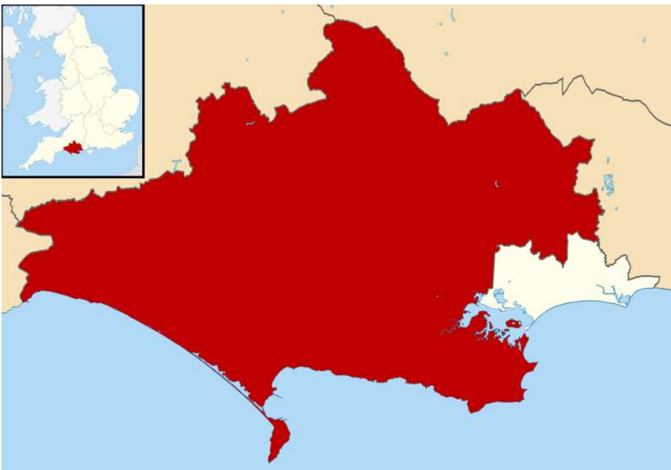
Figure 2. Map of Dorset area

Figure 2 shows an outline map of the Dorset Council administrative area.