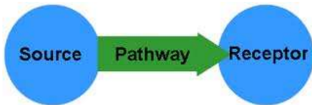
Figure 1. 'Source – pathway – receptor' model of pollutant linkage

If any one of the three key elements of a pollutant linkage is absent, the site in question will fail to meet the definition of contaminated land.